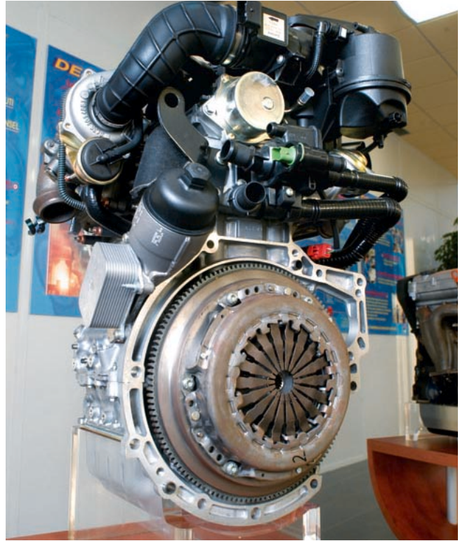
Française de Mécanique is one of the most productive motor manufacturers in the world, with production in 2003 reaching over 10,000 engines in just one day.

Now we are changing it every seven months and I think we can easily make it to a year,” he says. This has dramatically reduced the consumption of wash liquid and the amount of waste produced, with consequent environmental benefits.