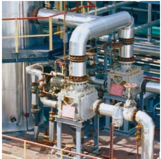
Compabloc reboilers operating with steam as heating medium

Compabloc is the most compact reboiler solution available on the market today. The reboilers installed at the YUKOS plant are a good example of the Compabloc thermosiphon concept. While one unit would have been adequate, the customer chose to install two parallel units in order to prevent any unnecessary shutdowns during cleaning procedures. Circulation of the medium is carried out by means of the thermosiphon system.