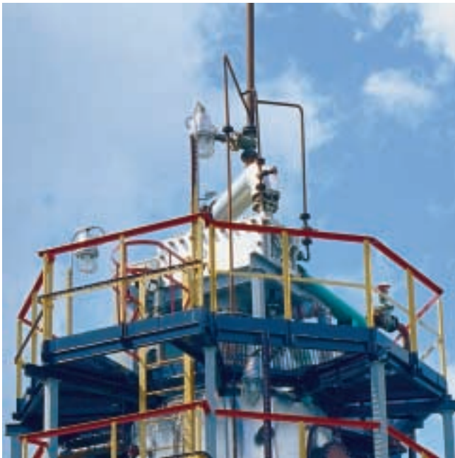
Compabloc reflux condenser mounted directly on the column

The reflux condenser installed at the YUKOS plant is a good example of the versatility of a Compabloc solution. The Compabloc reflux condenser is mounted directly on the stripper column, which saves costs in connection with installing foundations, piping and pumps. The alternative is a shell-and-tube unit mounted at ground level, with piping for the vapour going down, and a pump and piping for the reflux going back up to the top of the column.