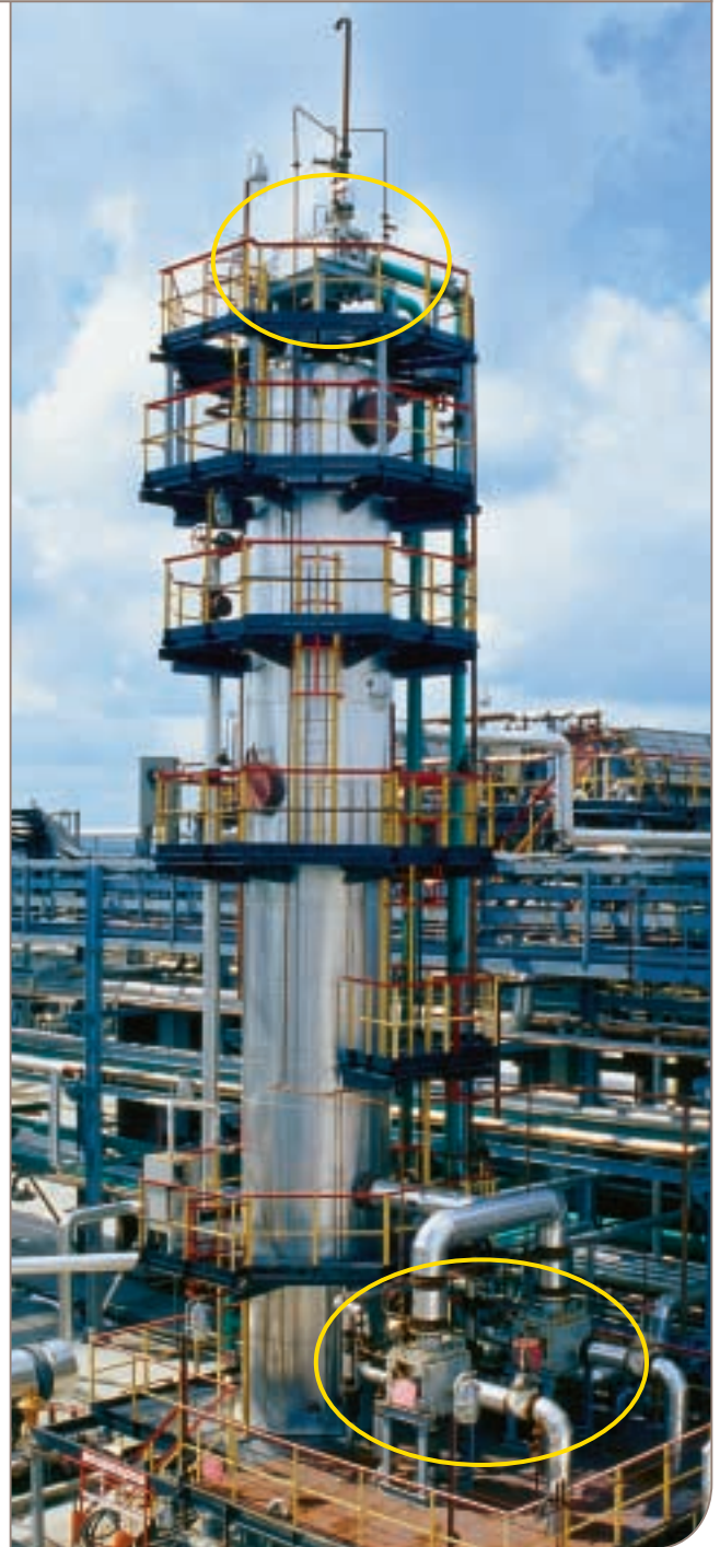
Stripper tower in gas sweetening process, with reboilers and reflux condenser marked with circles (close-ups on next page)

The decision to install the extremely compact Compabloc solution instead of traditional shell-and-tube units enabled YUKOS to save both money and space. The Compabloc reboilers have been in operation since January 2002, and the general consensus of opinion at the Syzran refinery is that the Compabloc units work extremely well.