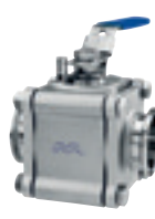
Ball Valve UltraPure