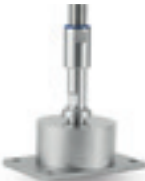
Weighing Systems UltraPure