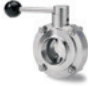
LKB With Standard Handle