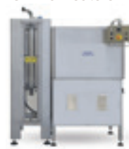
Sterilohm Standard PR