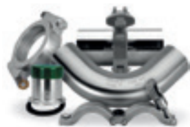
Tubes and Fittings