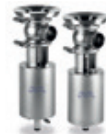
Unique SSV Tank Outlet