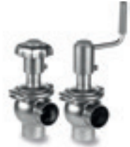
Unique SSV Manually Operated