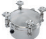
Access Tank Covers (Circular)