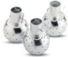
LKRK Static Spray Ball