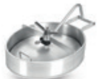
Access Tank Covers (Oval)