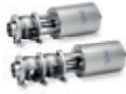
Unique SSV Tangential