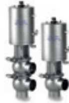
Unique SSV Two-Step