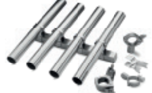
Tubes and Tube Support