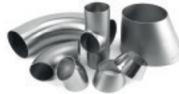
Bends, Tees and Reducers