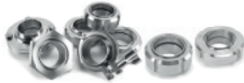
Flanges, Clamps and Unions