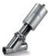
Unique SSV Y-Body