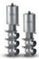
Unique SSV Reverse-Acting