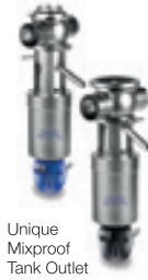
Unique Mixproof Tank Outlet