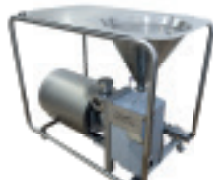
Hybrid Powder Mixer