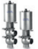
Unique SSV (Standard Configuration)