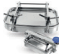
Access Tank Covers (Rectangular)