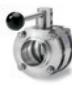
LKB-F For Flange Connections