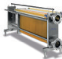
Plate and Frame Membrane (Unit)