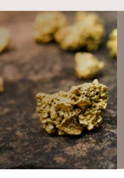
The supplier shall inform Alfa Laval if tin, tantalum, tungsten and/ or gold is present in the products supplied to Alfa Laval.